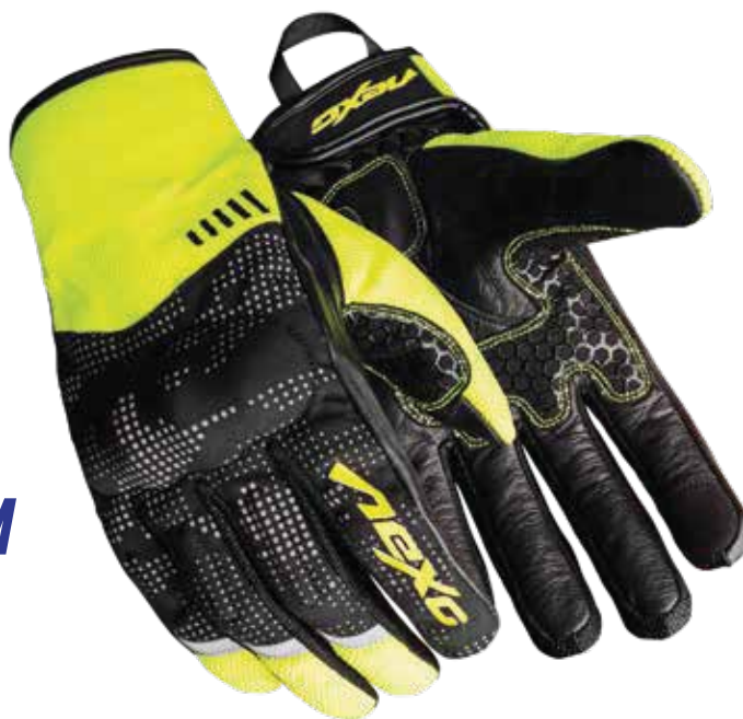
COLOR: BLACK, FL.YELLOW