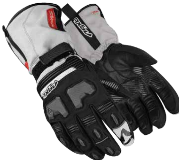
COLOR: BLACK, ICE GREY