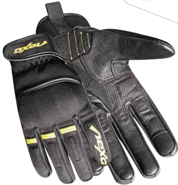
COLOR: BLACK, FL.YELLOW