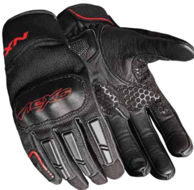
COLOR: BLACK, RED