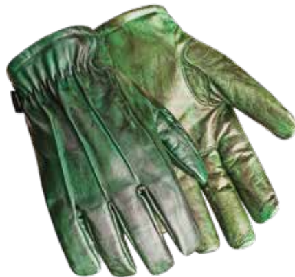
COLOR: OLIVE GREEN