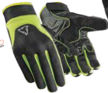
COLOR: BLACK, FL-YELLOW

TPR SOFT PADDING micro FIBER VELCRO STRAP