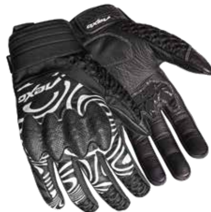
COLOR: BLACK, WHITE