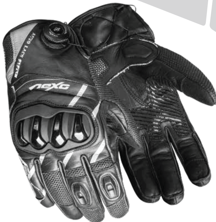
COLOR: BLACK, GREY