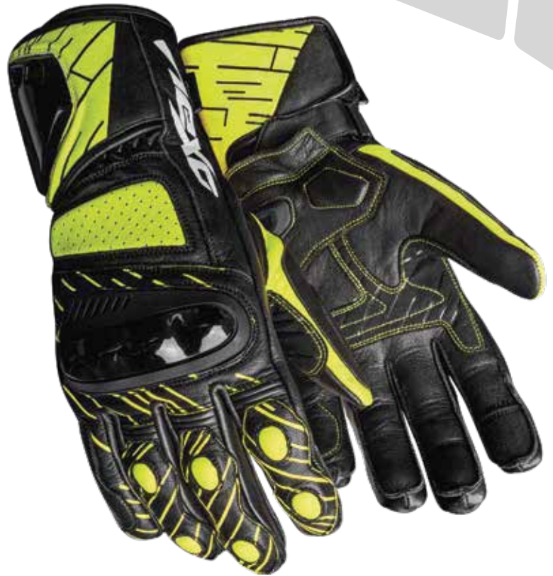
COLOR: BLACK, FL.YELLOW