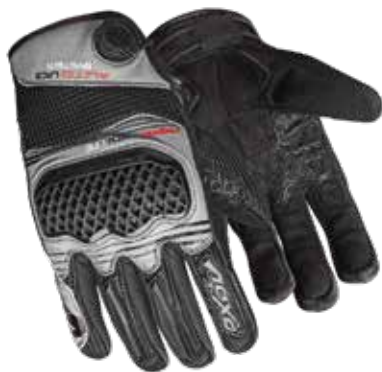
COLOR: BLACK, DARK GREY