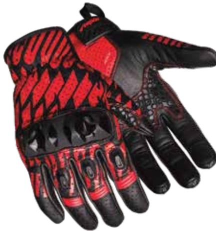
COLOR: BLACK, RED