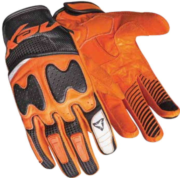
COLOR: BLACK, ORANGE, WHITE