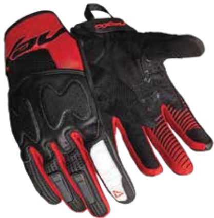
COLOR: BLACK, RED, WHITE