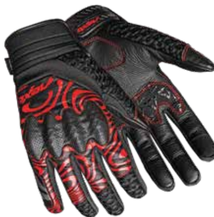
COLOR: BLACK, RED