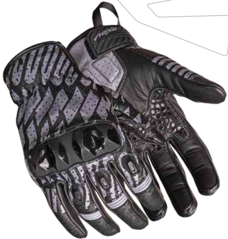
COLOR: BLACK, DARK GREY