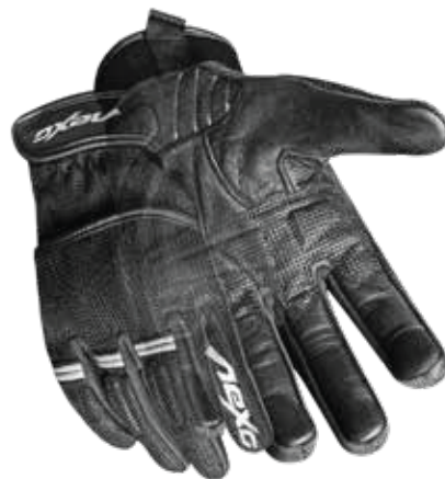
COLOR: BLACK, DARK GREY