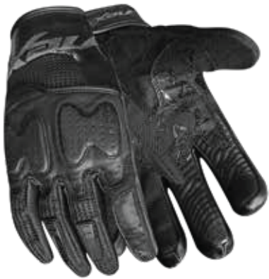
COLOR: BLACK, DARK GREY