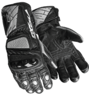
COLOR: BLACK, DARK GREY