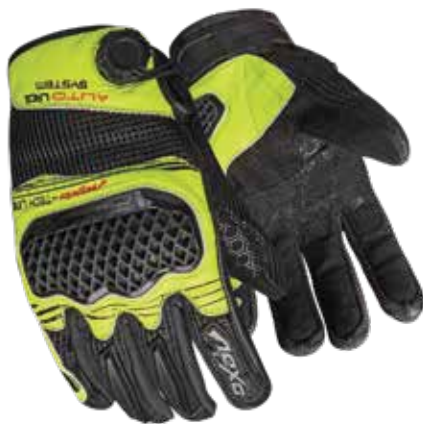
COLOR: BLACK, FL.YELLOW