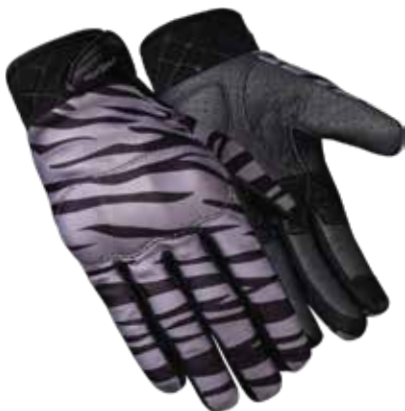
COLOR: BLACK, GREY