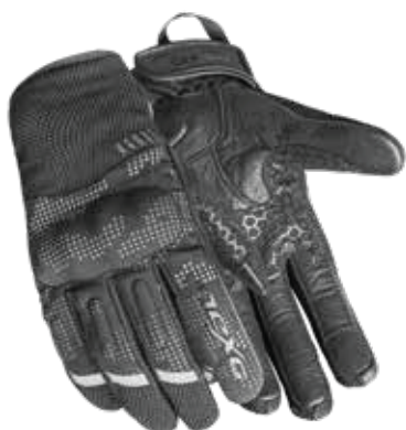
COLOR: BLACK, DARK GREY