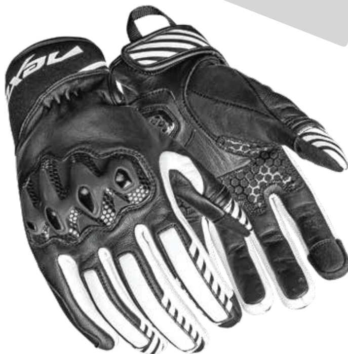
COLOR: BLACK, WHITE