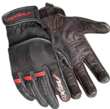
COLOR: BLACK, RED