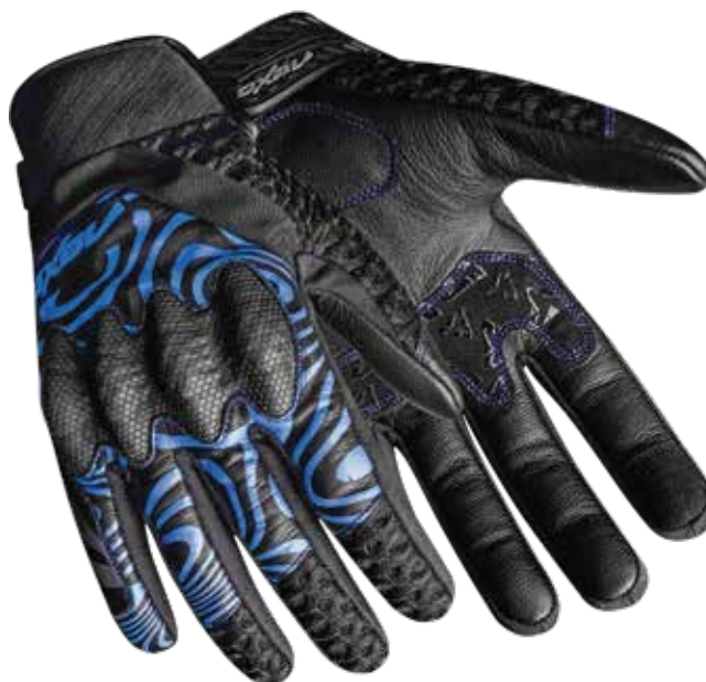
COLOR: BLACK, BLUE