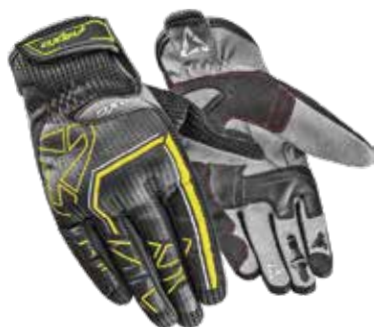
COLOR: BLACK, GREY, YELLOW, WHITE

3D MESH SOFT PADDING TPU micro FIBER KNUCKLE