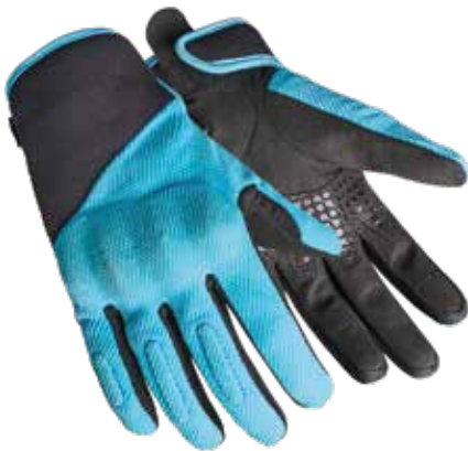
COLOR: BLACK, SKY BLUE