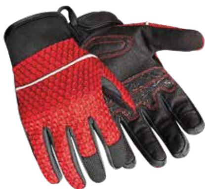
COLOR: BLACK, RED