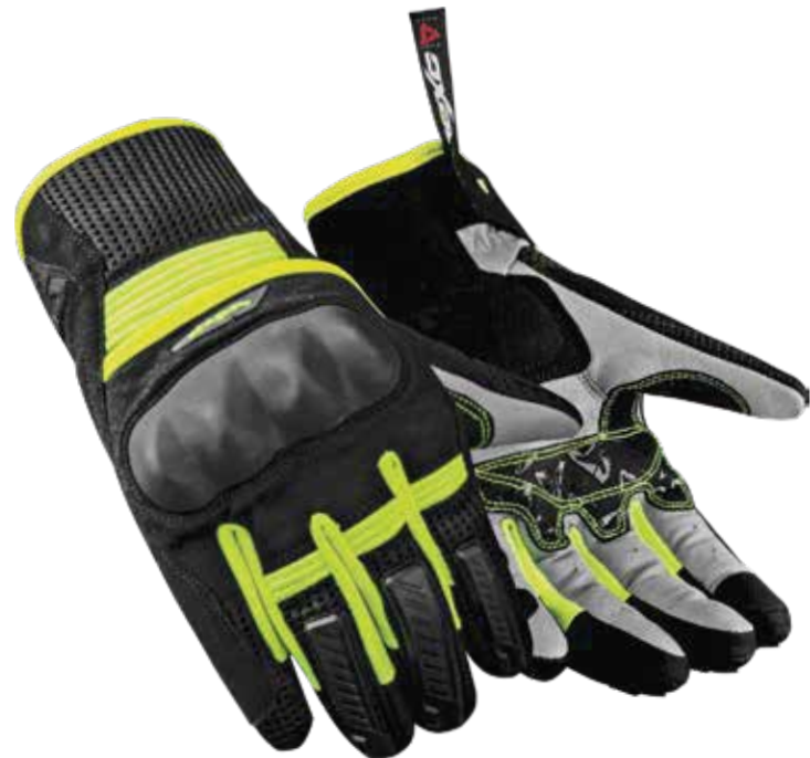
COLOR: BLACK, GREY, FL.YELLOW