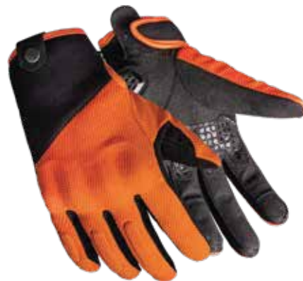
COLOR: BLACK, ORANGE