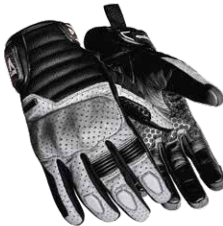
COLOR: BLACK, DARK GREY