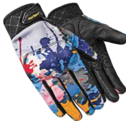
COLOR: BLACK, MULTI COLOR