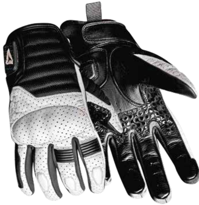
COLOR: BLACK, WHITE