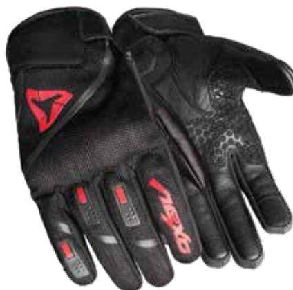
COLOR: BLACK, RED