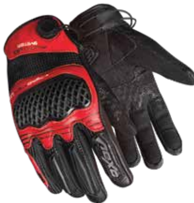
COLOR: BLACK, RED