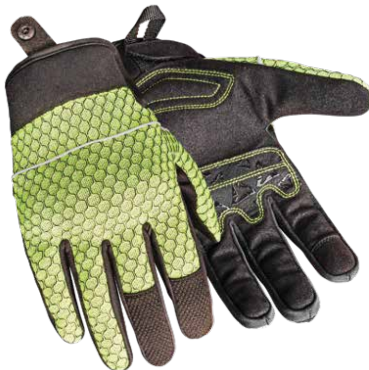
COLOR: BLACK, FL.YELLOW