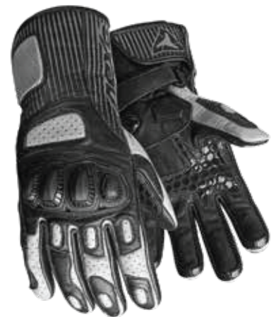
COLOR: BLACK, DARK GREY