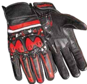
COLOR: BLACK, RED, WHITE