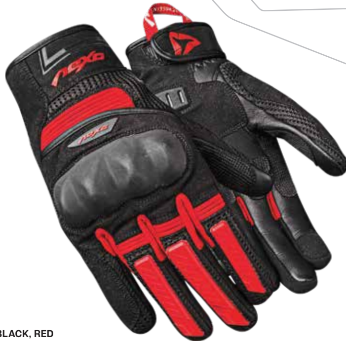
COLOR: BLACK, RED

3D MESH TPU VELCRO STRAP side PALM micro FIBER TPR