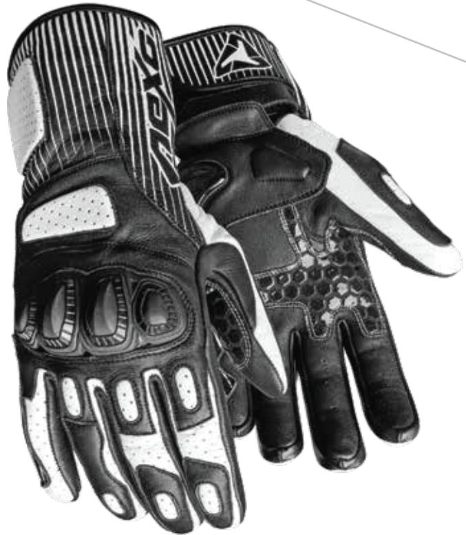
COLOR: BLACK, WHITE