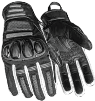
COLOR: BLACK, WHITE, GREY