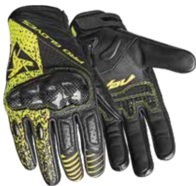
COLOR: BLACK, FL.YELLOW