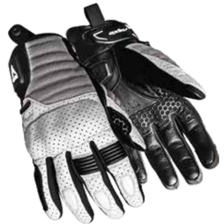
COLOR: BLACK, WHITE, GREY