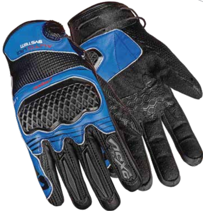
COLOR: BLACK, BLUE