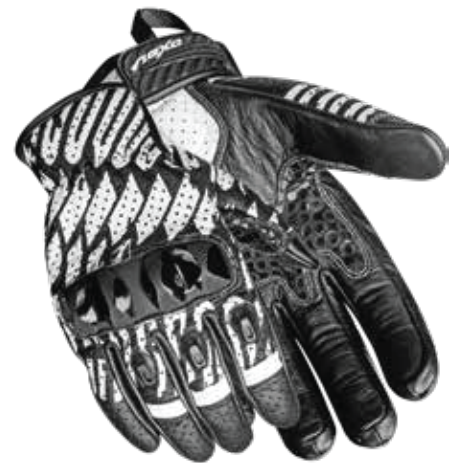
COLOR: BLACK, WHITE