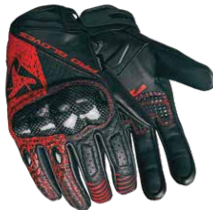
COLOR: BLACK, RED