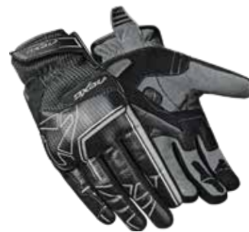
COLOR: BLACK, GREY