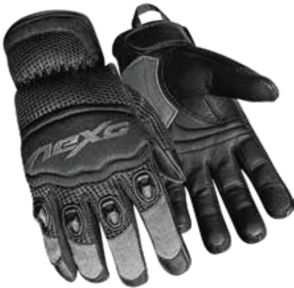
COLOR: BLACK, DARK GREY