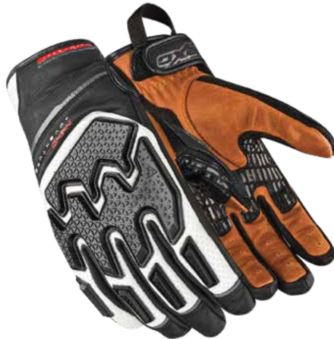
COLOR: BLACK, BROWN, WHITE