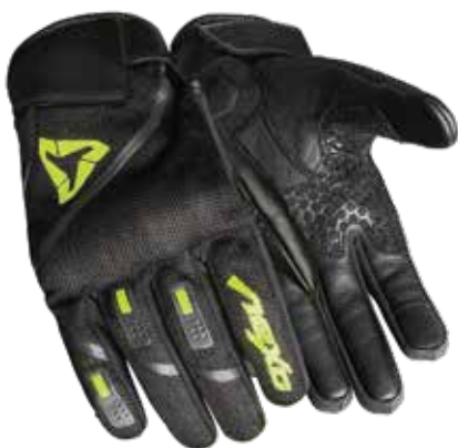
COLOR: BLACK, FL.YELLOW