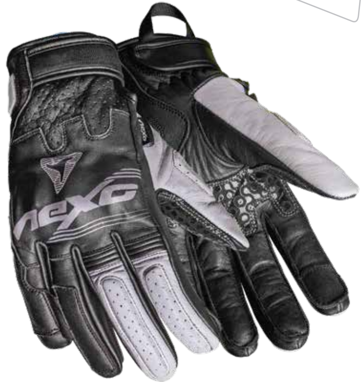
COLOR: BLACK, DARK GREY