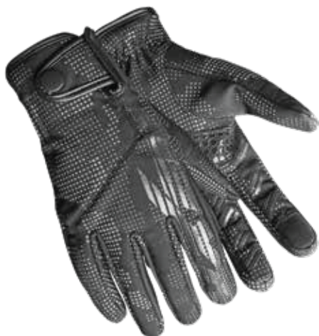
COLOR: BLACK, GREY