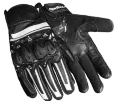
COLOR: BLACK, WHITE, GREY