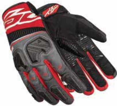
COLOR: BLACK, RED, GREY