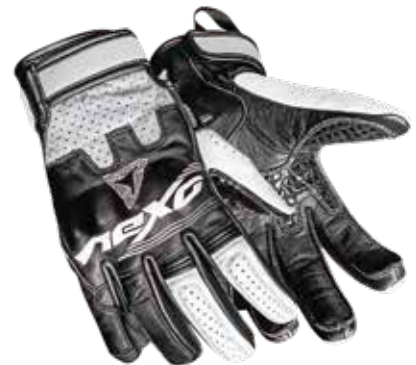
COLOR: BLACK, WHITE, GREY