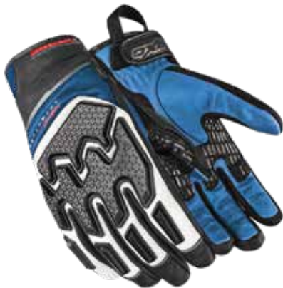
COLOR: BLACK, BLUE, WHITE