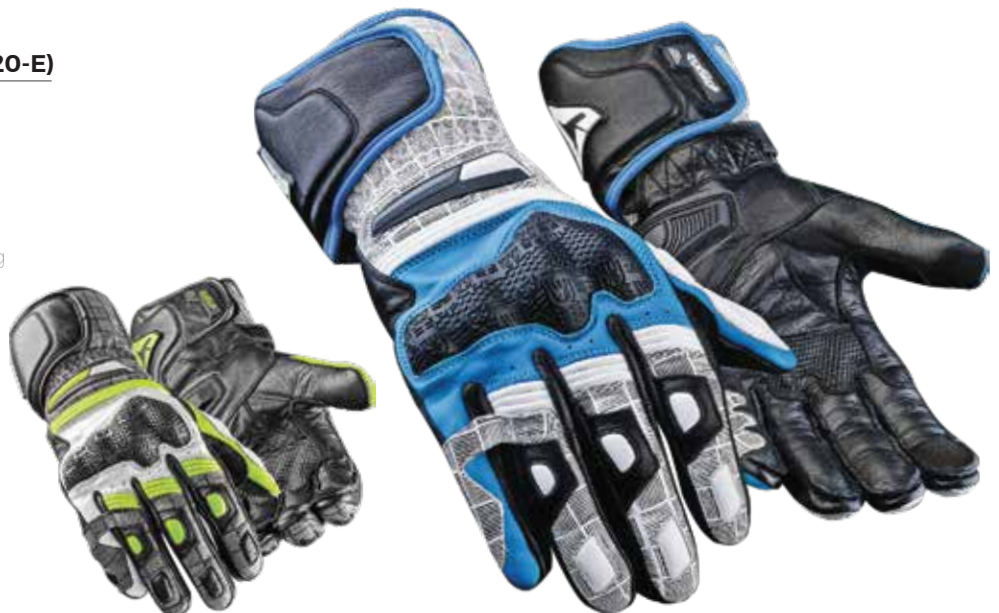
COLOR: BLACK, WHITE, FL.YELLOW