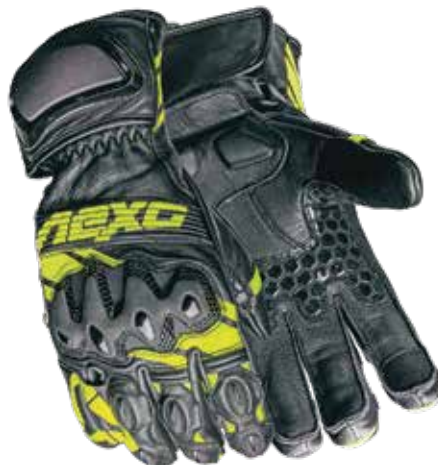
COLOR: BLACK, FL.YELLOW