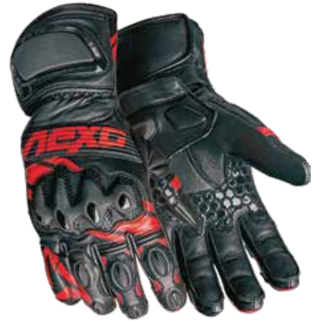
COLOR: BLACK, RED