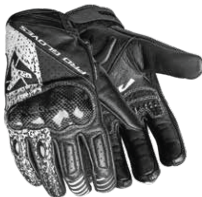
COLOR: BLACK, WHITE