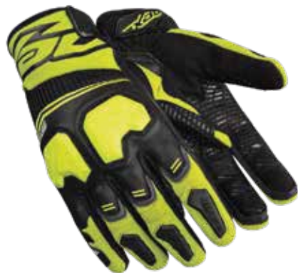
COLOR: BLACK, FL.YELLOW