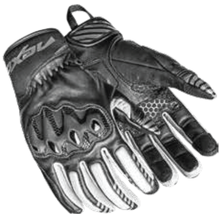
COLOR: BLACK, DARK GREY