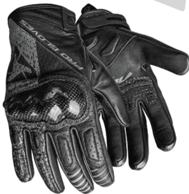
COLOR: BLACK, DARK GREY