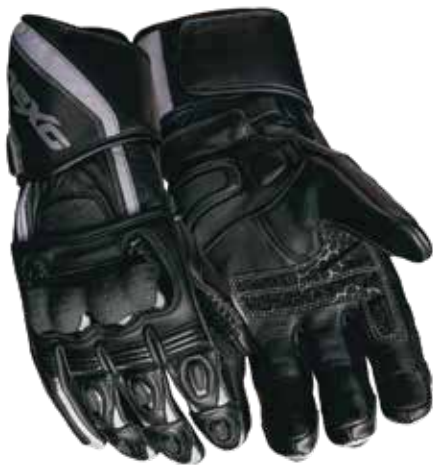
COLOR: BLACK, GREY