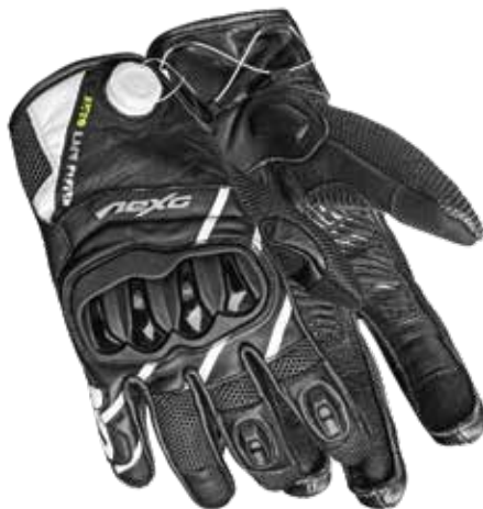
COLOR: BLACK, WHITE