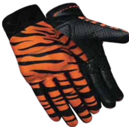
COLOR: BLACK, ORANGE