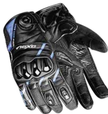
COLOR: BLACK, BLUE