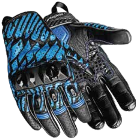
COLOR: BLACK, BLUE