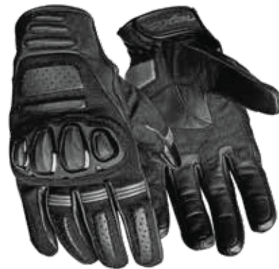
COLOR: BLACK, DARK GREY