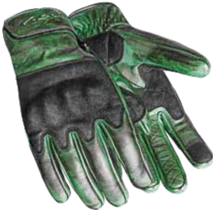
COLOR: OLIVE GREEN, BLACK