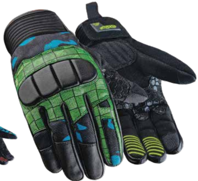
COLOR: BLACK, GREEN, FL.YELLOW, AQUA