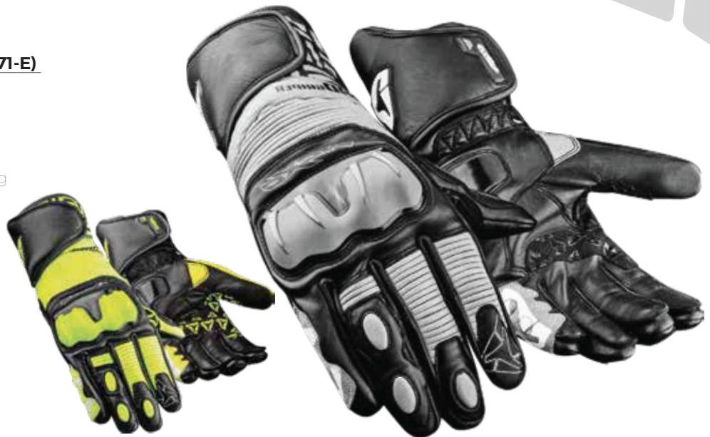
COLOR: BLACK, FL.YELLOW