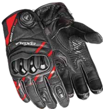
COLOR: BLACK, RED