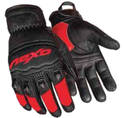
COLOR: BLACK, RED