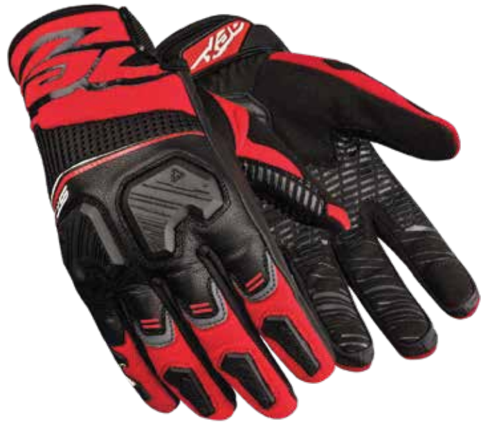
COLOR: BLACK, RED