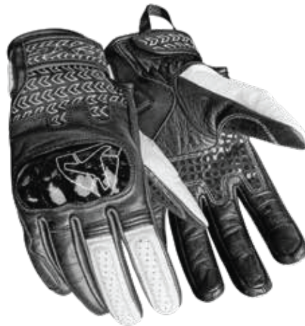
COLOR: BLACK, WHITE