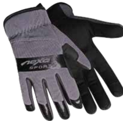
COLOR: BLACK, GREY