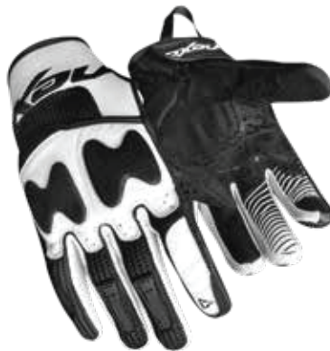
COLOR: BLACK, WHITE