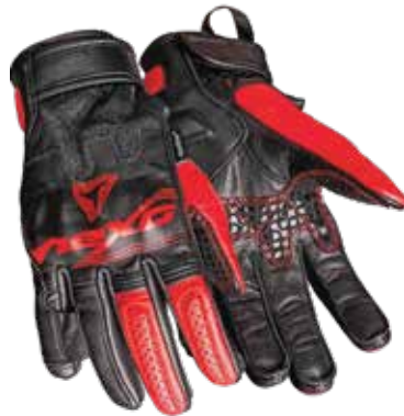
COLOR: BLACK, RED