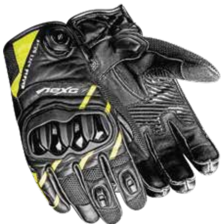
COLOR: BLACK, FL.YELLOW