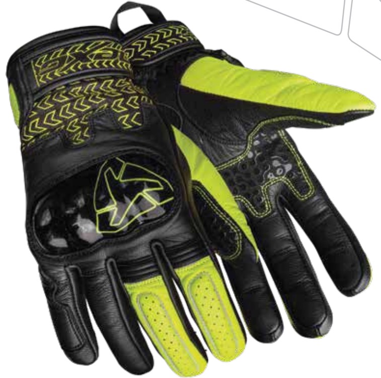
COLOR: BLACK, FL. YELLOW