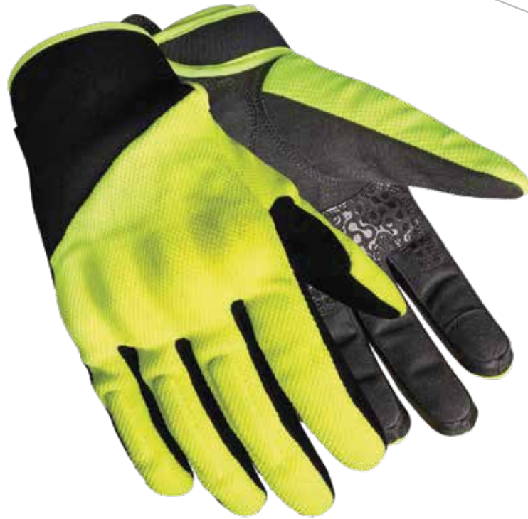
COLOR: BLACK, FL.YELLOW