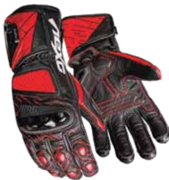
COLOR: BLACK, RED