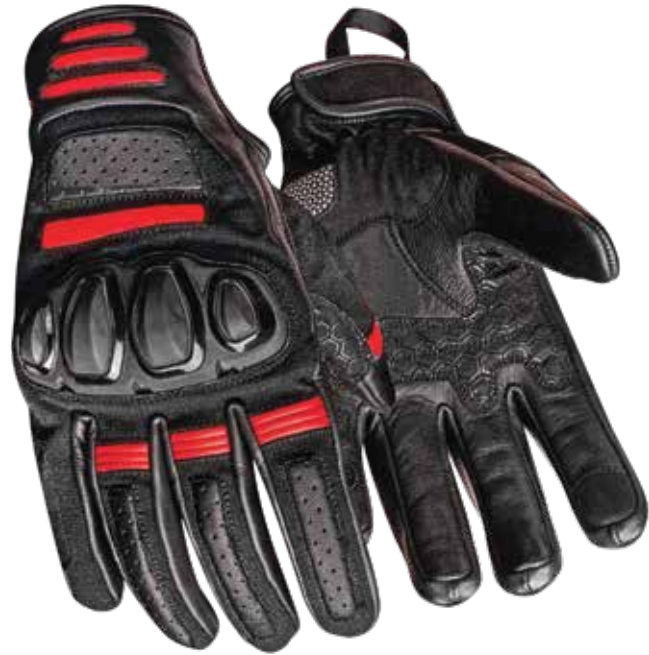
COLOR: BLACK, RED