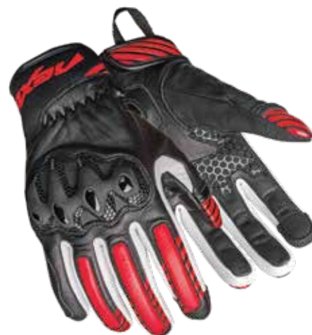
COLOR: BLACK, WHITE, RED