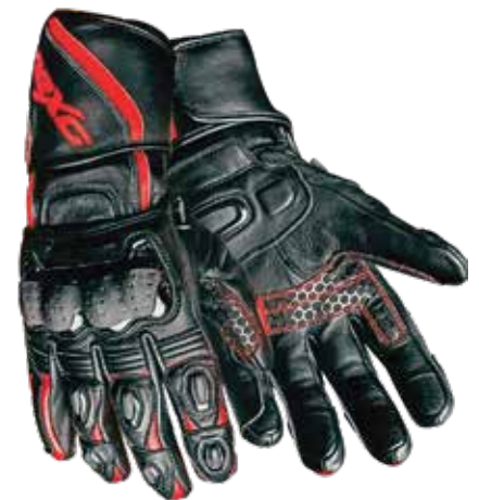
COLOR: BLACK, RED