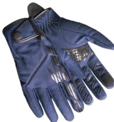
COLOR: BLUE, BLACK