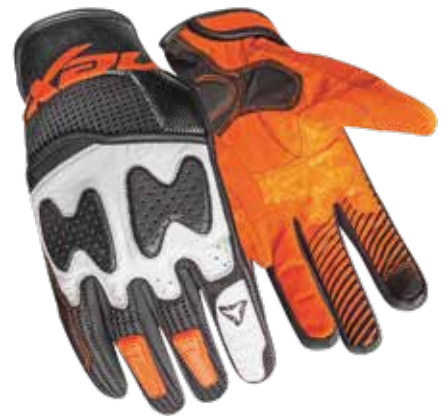
COLOR: BLACK, WHITE, ORANGE