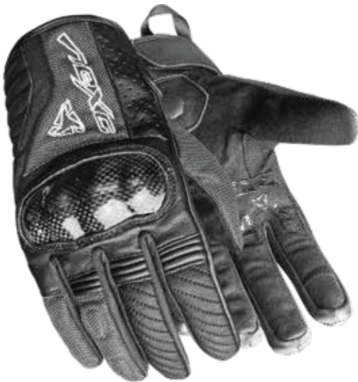
COLOR: BLACK, DARK GREY