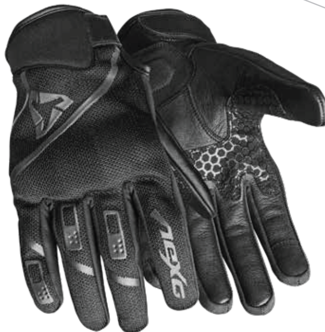
COLOR: BLACK, DARK GREY