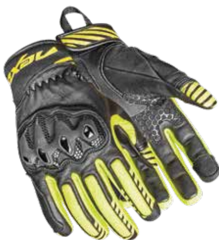
COLOR: BLACK, FL.YELLOW