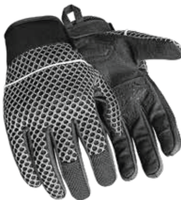
COLOR: BLACK, WHITE