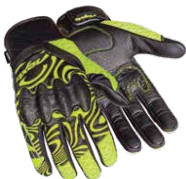
COLOR: BLACK, FL.YELLOW