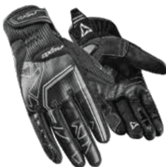
COLOR: BLACK, GREY, WHITE