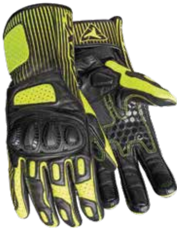
COLOR: BLACK, FL.YELLOW