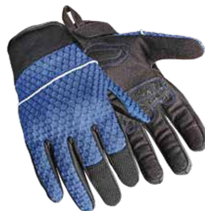
COLOR: BLACK, BLUE