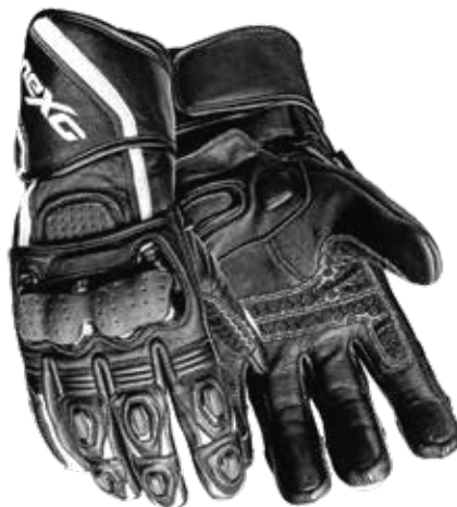
COLOR: BLACK, WHITE