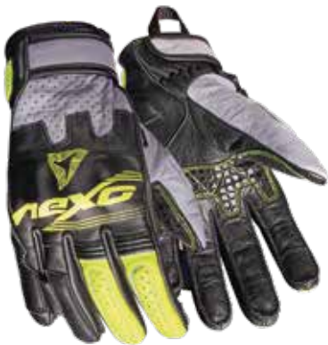
COLOR: BLACK, FL.YELLOW, DARK GREY