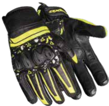
COLOR: BLACK, FL.YELLOW, WHITE