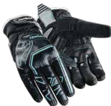
COLOR: BLACK, TURQUOISE, WHITE