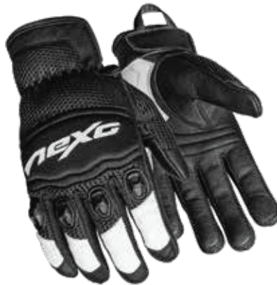
COLOR: BLACK, WHITE