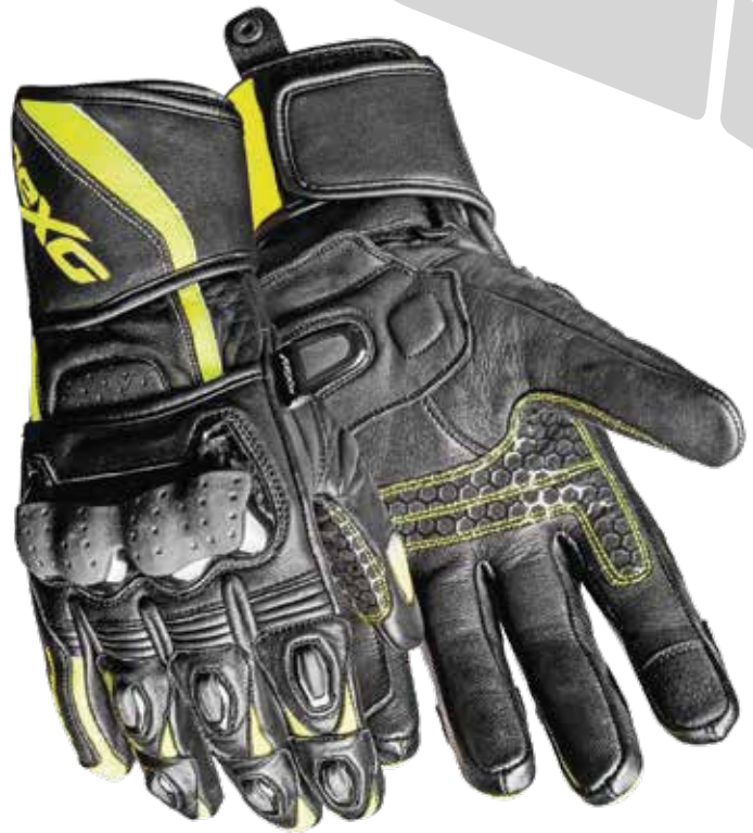
COLOR: BLACK, FL.YELLOW