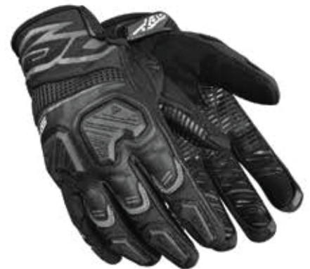
COLOR: BLACK, GREY