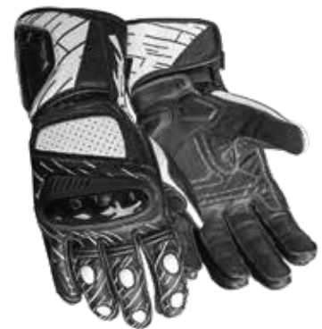
COLOR: BLACK, WHITE