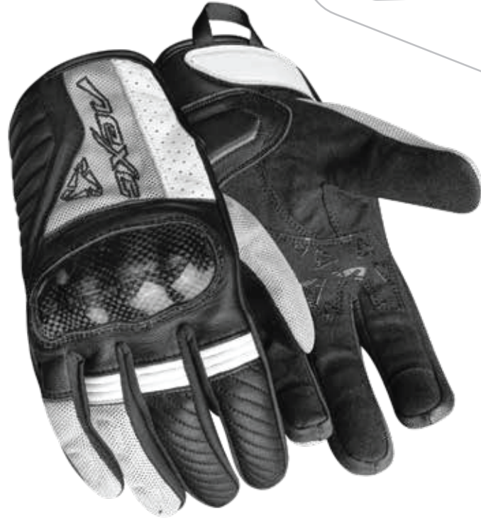
COLOR: BLACK, WHITE