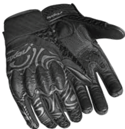
COLOR: BLACK, DARK GREY