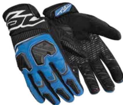
COLOR: BLACK, WHITE, BLUE