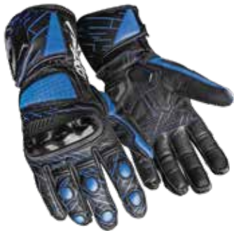
COLOR: BLACK, BLUE