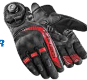
COLOR: BLACK, RED

TPU KNUCKLE closure SYSTEM stretch FABRIC micro FIBER