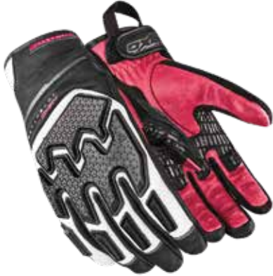
COLOR: BLACK, RED, WHITE