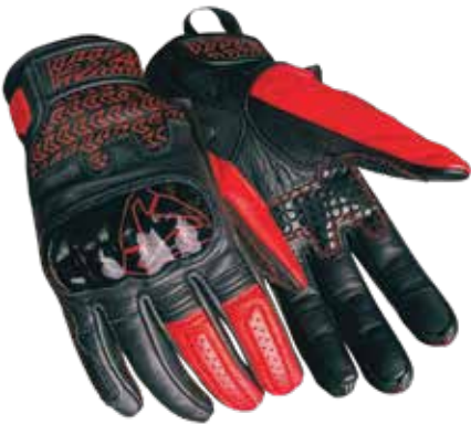
COLOR: BLACK, RED