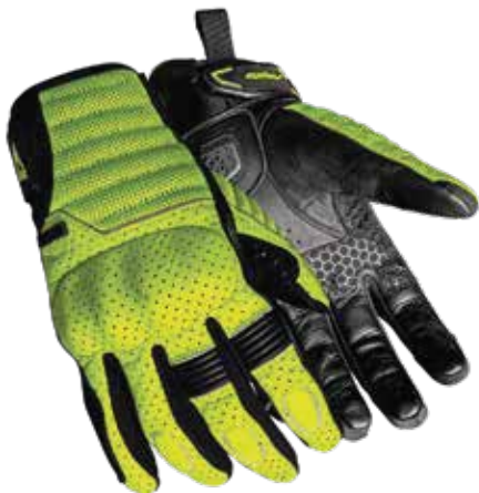
COLOR: BLACK, FL.YELLOW