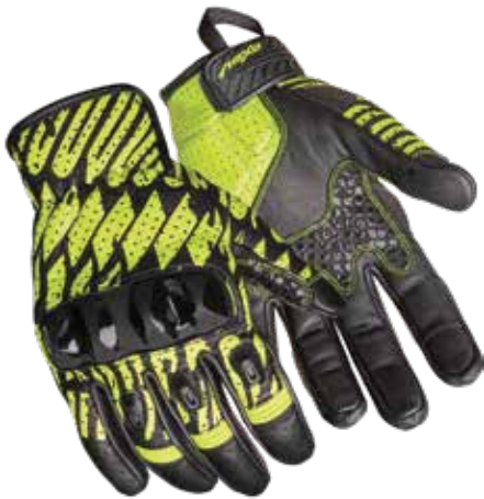
COLOR: BLACK, FL.YELLOW