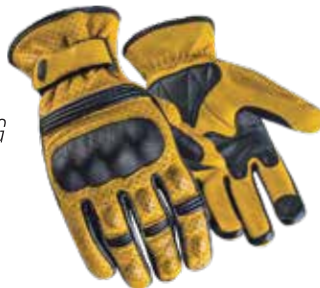
COLOR: YELLOW, BLACK