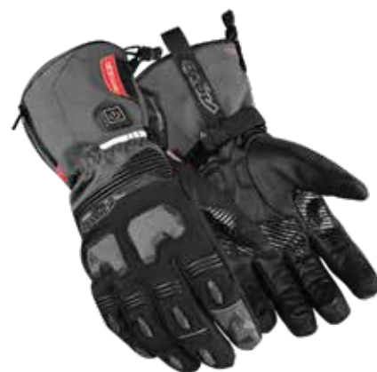
COLOR: BLACK, DARY GREY