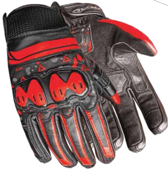
COLOR: BLACK, RED, GREY