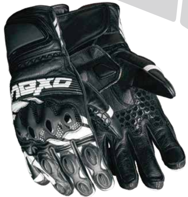
COLOR: BLACK, WHITE