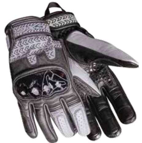
COLOR: BLACK, DARK GREY