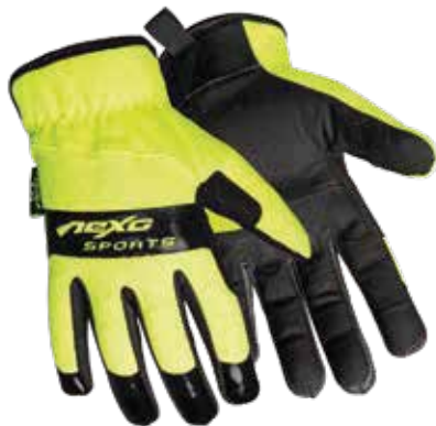
COLOR: BLACK, FL.YELLOW