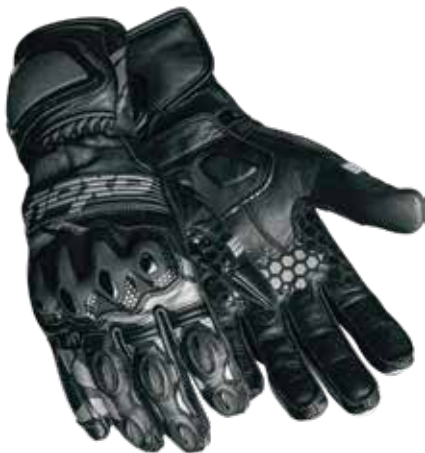
COLOR: BLACK, DARK GREY