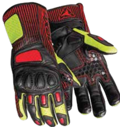
COLOR: BLACK, RED , FL.YELLOW