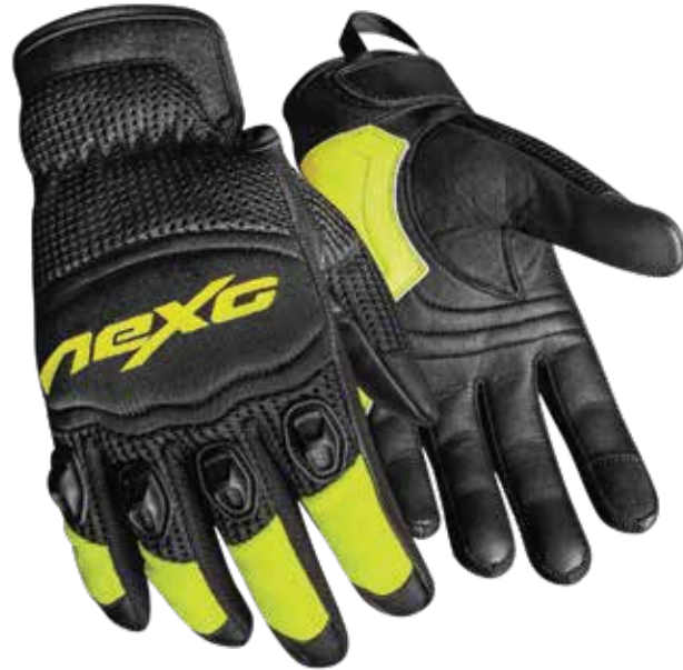
COLOR: BLACK, FL.YELLOW