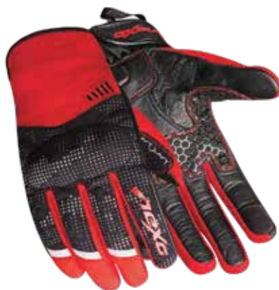
COLOR: BLACK, RED, DARK GREY