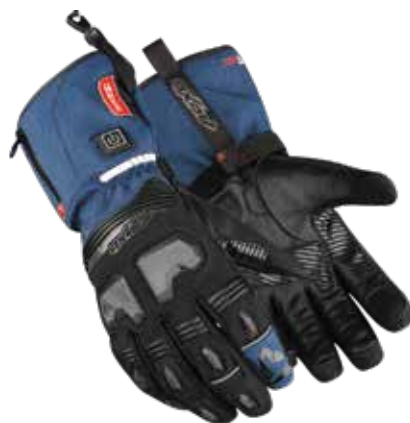
COLOR: BLACK, BLUE