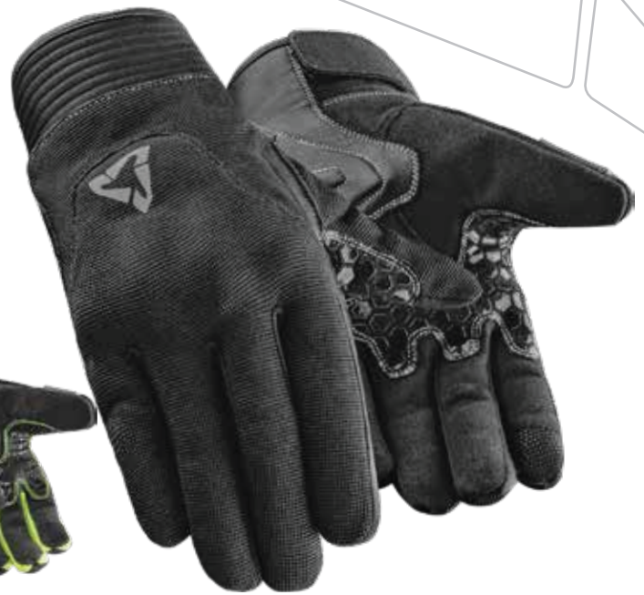
COLOR: BLACK, GREY