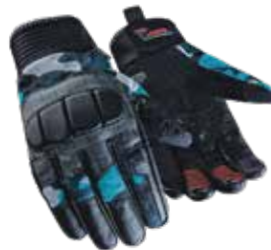
COLOR: BLACK, GREY, AQUA, RED