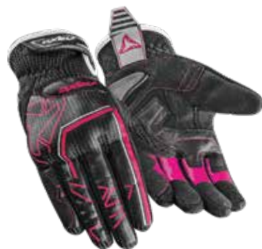
COLOR: BLACK, PINK, WHITE