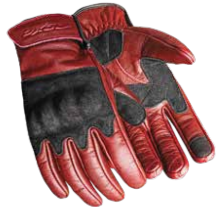
COLOR: MAROON, BLACK