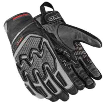
COLOR: BLACK, GREY